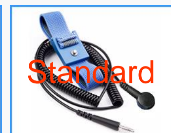
❖ Wrist strap connection

Allows grounding while handling ESD sensitive materials