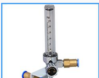
❖ Nitrogen valve (Model: HN2-01)

Effective usage of N 2 combined with Super Dry, help to accelerate the recovery time and oxidation prevention. Set the buttons on N 2 purge system itself