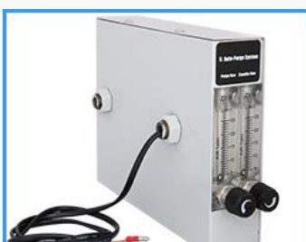
❖ Nitrogen auto purge system (Model AN2-03)

Simple N 2 flow meter 0-25L/min adjustable