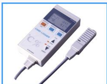
❖ Data logger with software (model MR6662)

Allows grounding while handling ESD sensitive materials