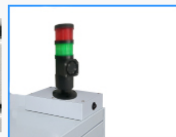
❖ Humidity alarm light

Alarm buzzer sounds when its internal humidity/ door open time exceeds set value