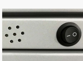
❖ Humidity/ Door open alarm buzzer

Suitable for storage of components on tape and reel, can pull out on rail