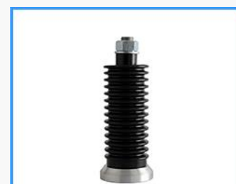
❖ Adjustable legs

Effective usage of N 2 combined with Super Dry, help to accelerate the recovery time and oxidation prevention. Set on digital control panel