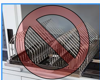
❖ SMD double rack (stainless steel)

Suitable for storage of components on tape and reel, can pull out on rail