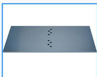
❖ Extra shelf

Greatly increase the usable space inside Super Dry