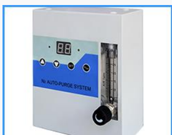
❖ Independent Nitrogen purge system (Model TN2-02)

Alarm light flashes and sounds when its internal humidity exceeds set value