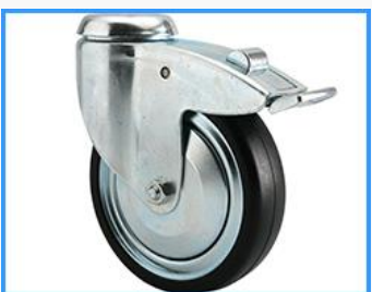
❖ Castors (4 pcs)

Data logging humidity and temperature, can read and output data by software with a PC