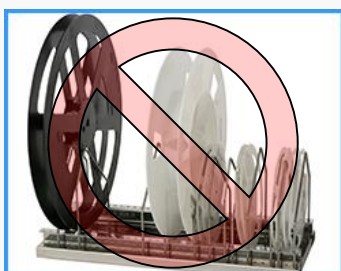
❖ SMD single rack (stainless steel)

Greatly increase the usable space inside Super Dry