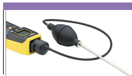
Gas extraction kit with pump and connector