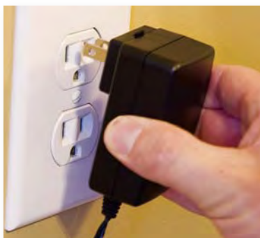
Patented power supply design helps give this iron outstanding performance