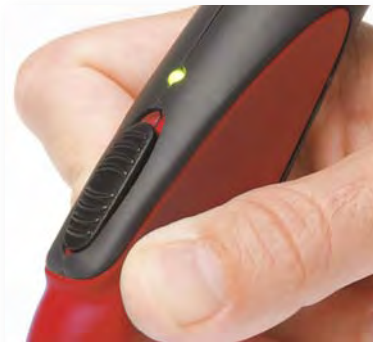
Red power-on LED turns green when iron reaches working temperature