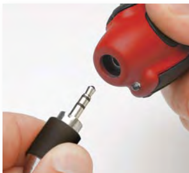
Easy and quick tip change-out with modular plug and rubberized sleeve