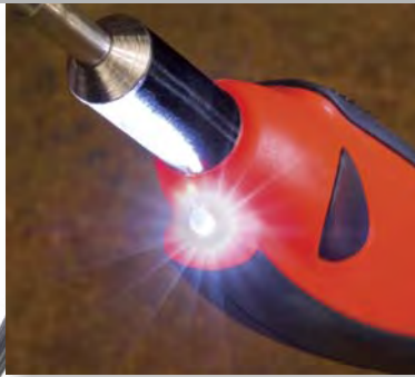
Bright LED illuminates the work, so its easier to make perfect solder joints